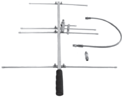
Pict. 1: DF Set

Peil-Set 301K - DF Set with directivity for the detection of spurious radiation